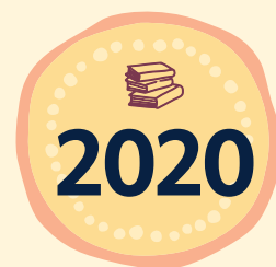
Australian School of the Year