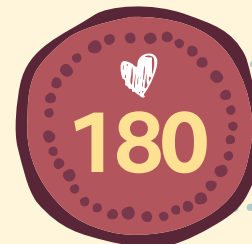
Wellbeing sessions delivered