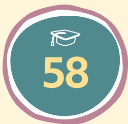
Current students K-12