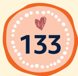
Students supported since 2007