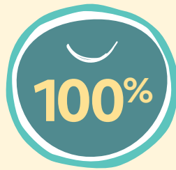
Year 3 students achieved top two bands in Writing