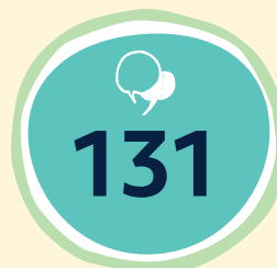
Speech and Occupational Therapy sessions delivered