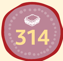
Nourishing lunches supplied