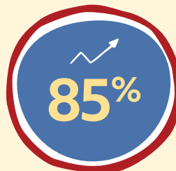
Attendance above First Nations state average